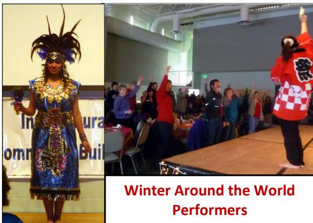
Winter Around the World Performers