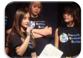
Finding their voice using the microphone →