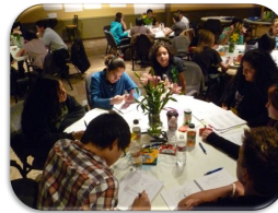
← Small group work creating Personal Visions

In 2011, ICB conducted two Intercultural Leadership Skills for Teen 3-day workshops. In February, 32 university, high school and middle school students participated, and in October, 28 students from Lincoln Middle School and Poudre High School attended. Both workshops were led by 7 ICB certified facilitators and 8 ICB Ambassadors who are alumni of the first teen workshop held in 2010. Both workshops were hosted by the Vineyard Church of the Rockies in their excellent Outback Room facility. Participants created their own Personal Vision Statements and created team Action Plans that focus on creating safer and more inclusive school and community environments.